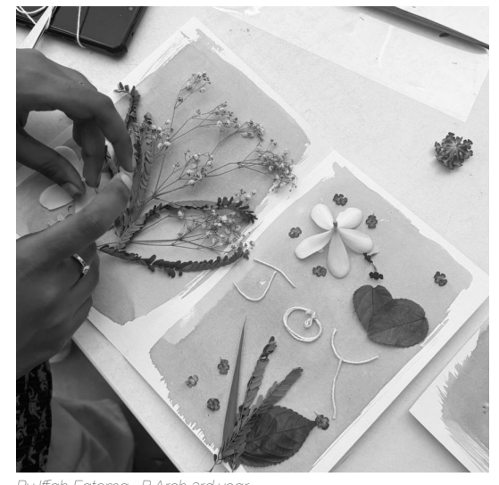
Cyanotype Workshop/ Atelier64