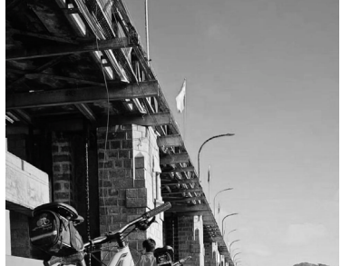
Cycle Ride/ Spavelo